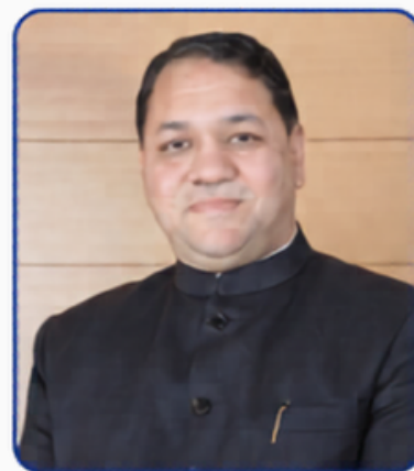
Hon. Shri. Dilip Walse Patil

Founder Chairman National Centre for Rural Development